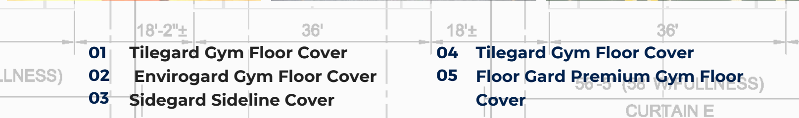
01 Tilegard Gym Floor Cover