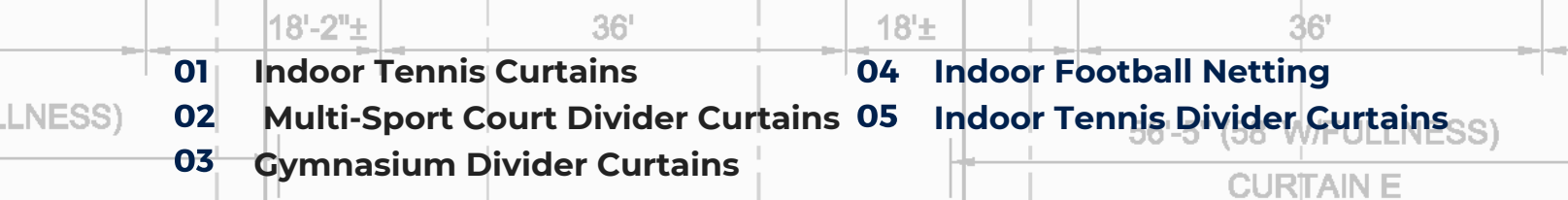
01 Indoor Tennis Curtains